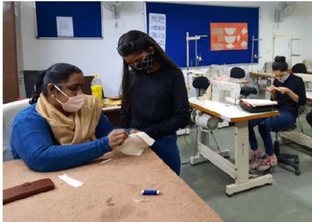
MASK MAKING TRAINING