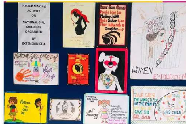
POSTER MAKING ON NATIONAL GIRLS CHILD DAY