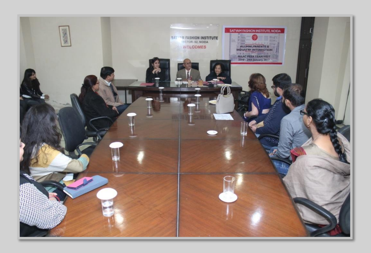
Interaction with parents