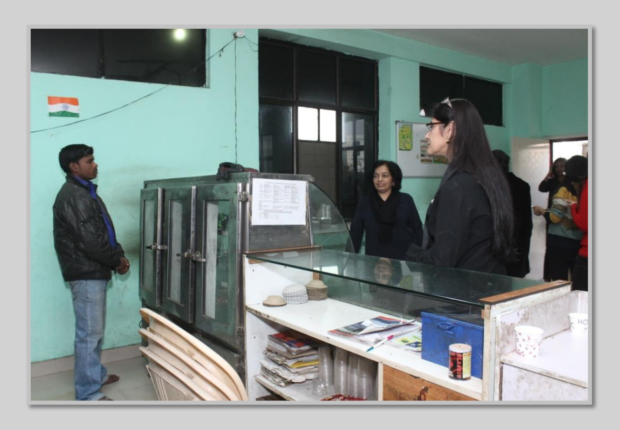
Visit to Canteen