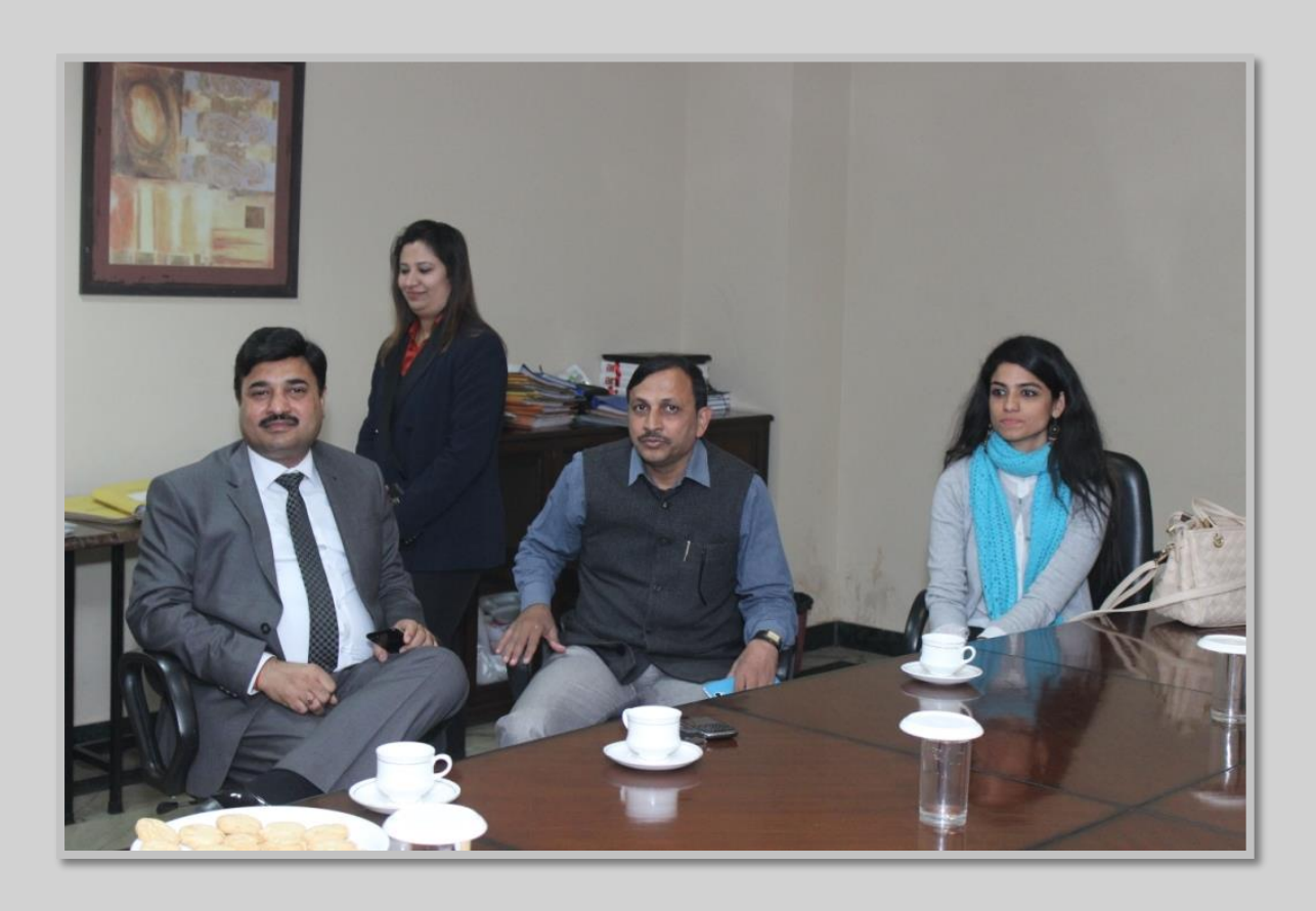
Interaction with industry persons