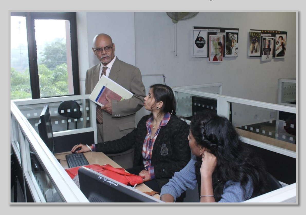
Visit to Computer lab