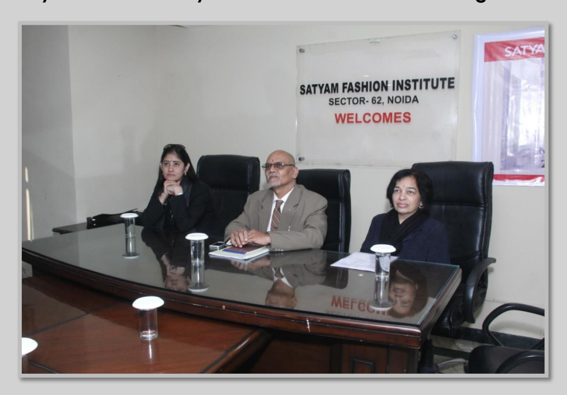
Principal's Presentation to NAAC Peer Team