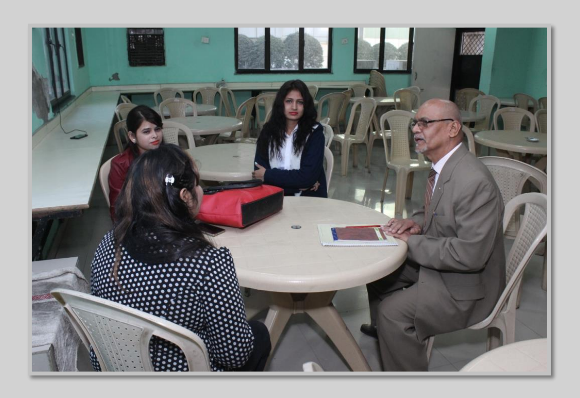
Visit to Canteen