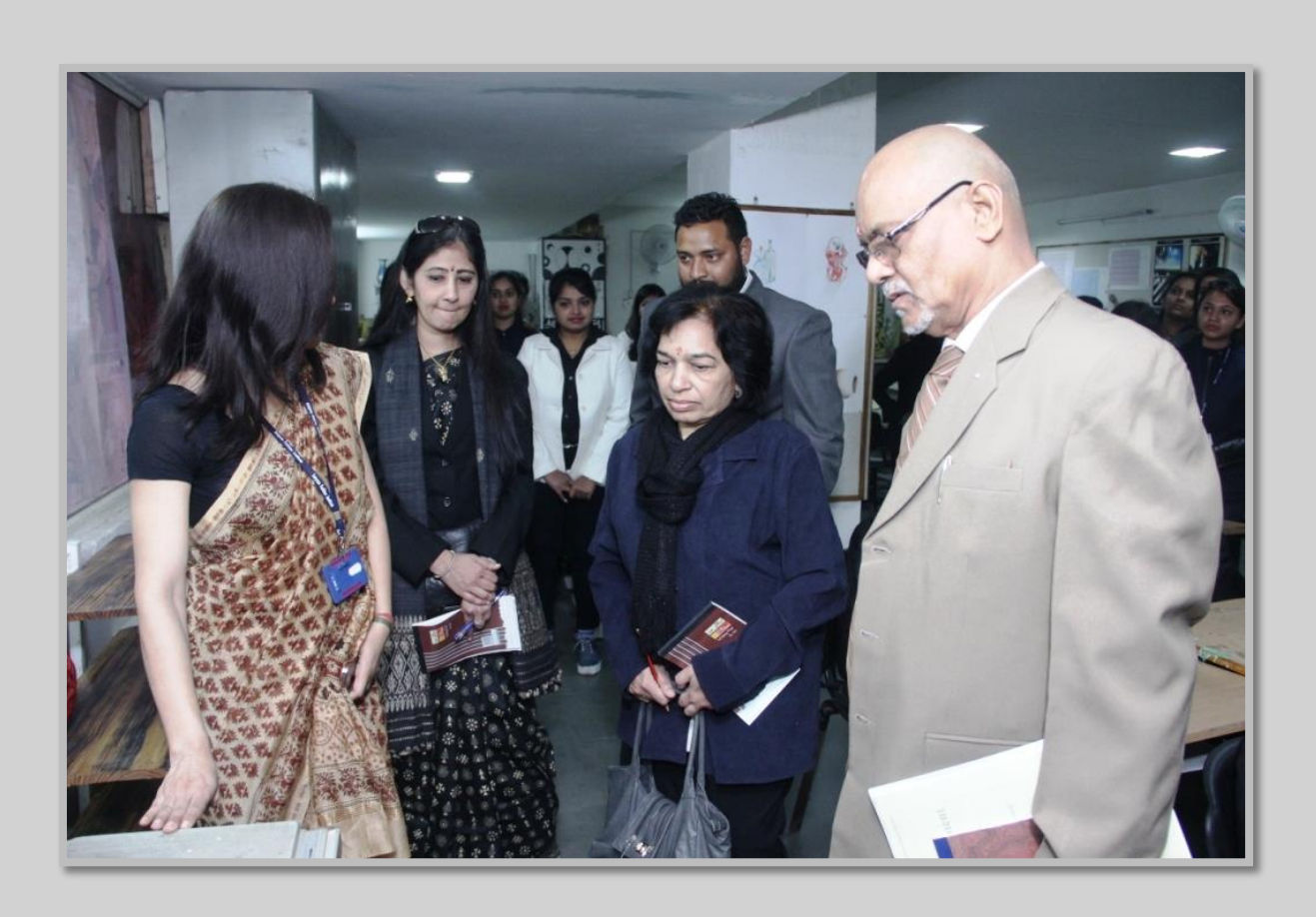
Visit to Product lab