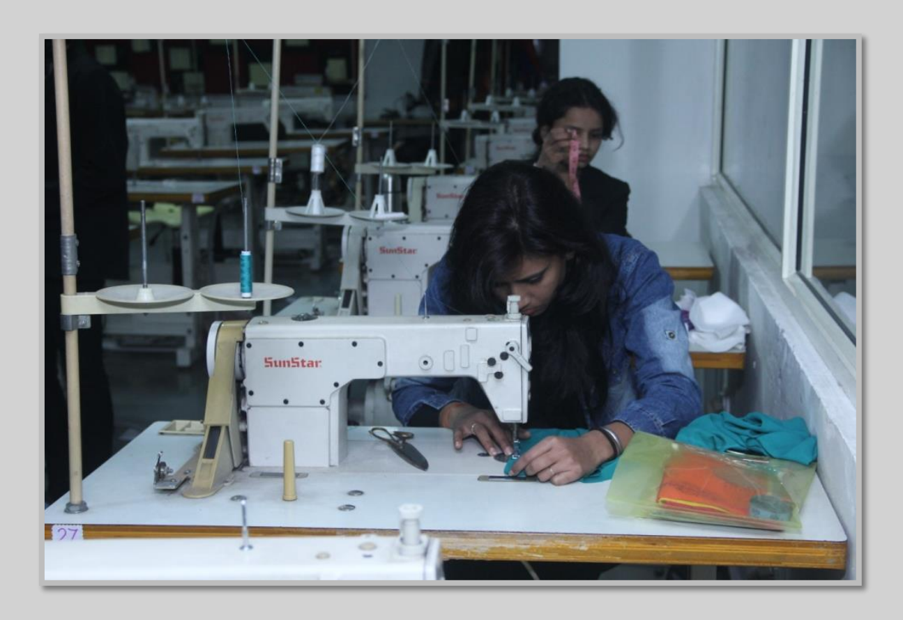
Visit to Garment Construction Lab