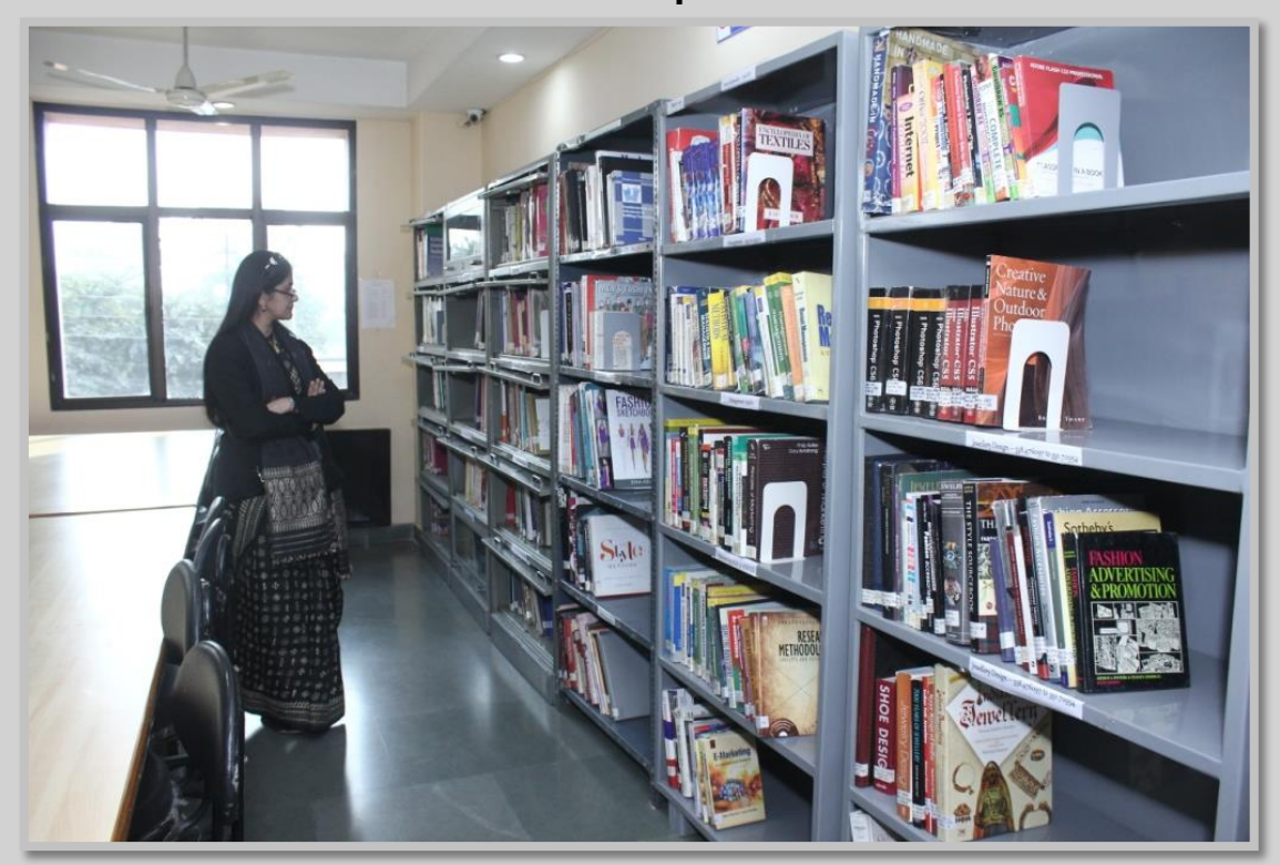
Visit to Library