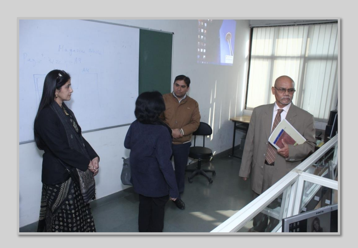
Interaction with IT In-charge