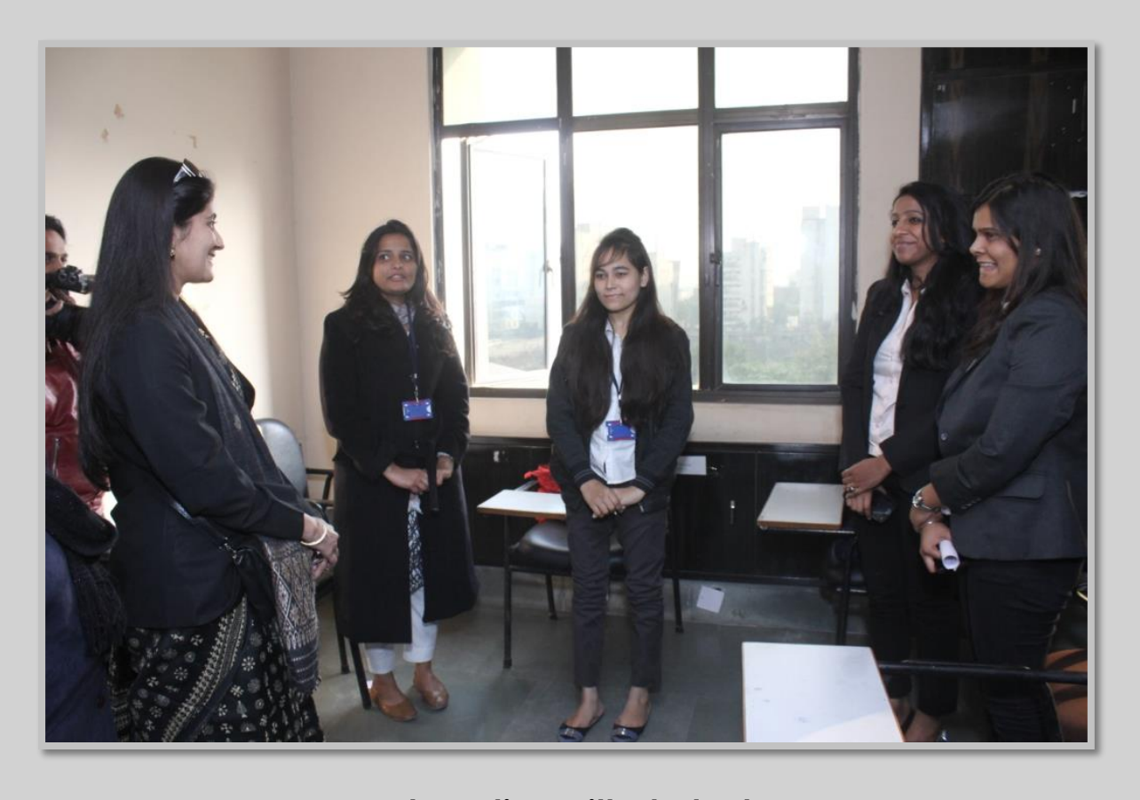
Interaction with students