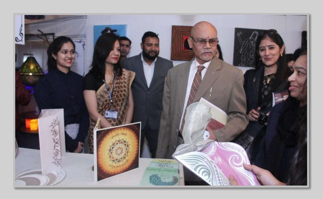
Visit to Exhibition by B. Des. Lifestyle Accessories students