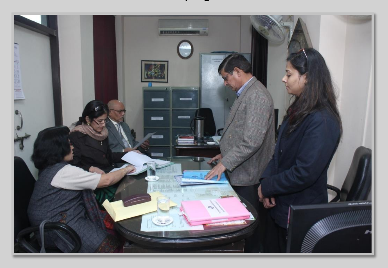
Checking of documentary evidences