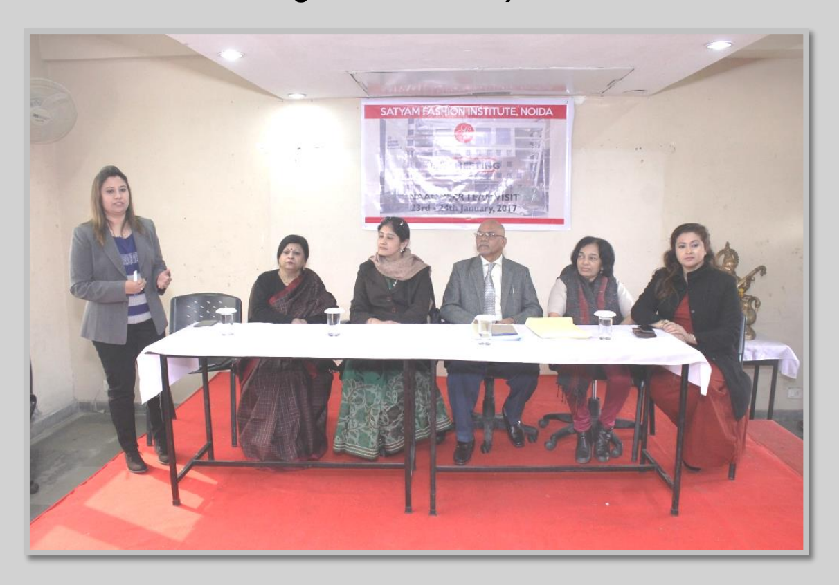
Exit Meeting – Welcome by IQAC Coordinator