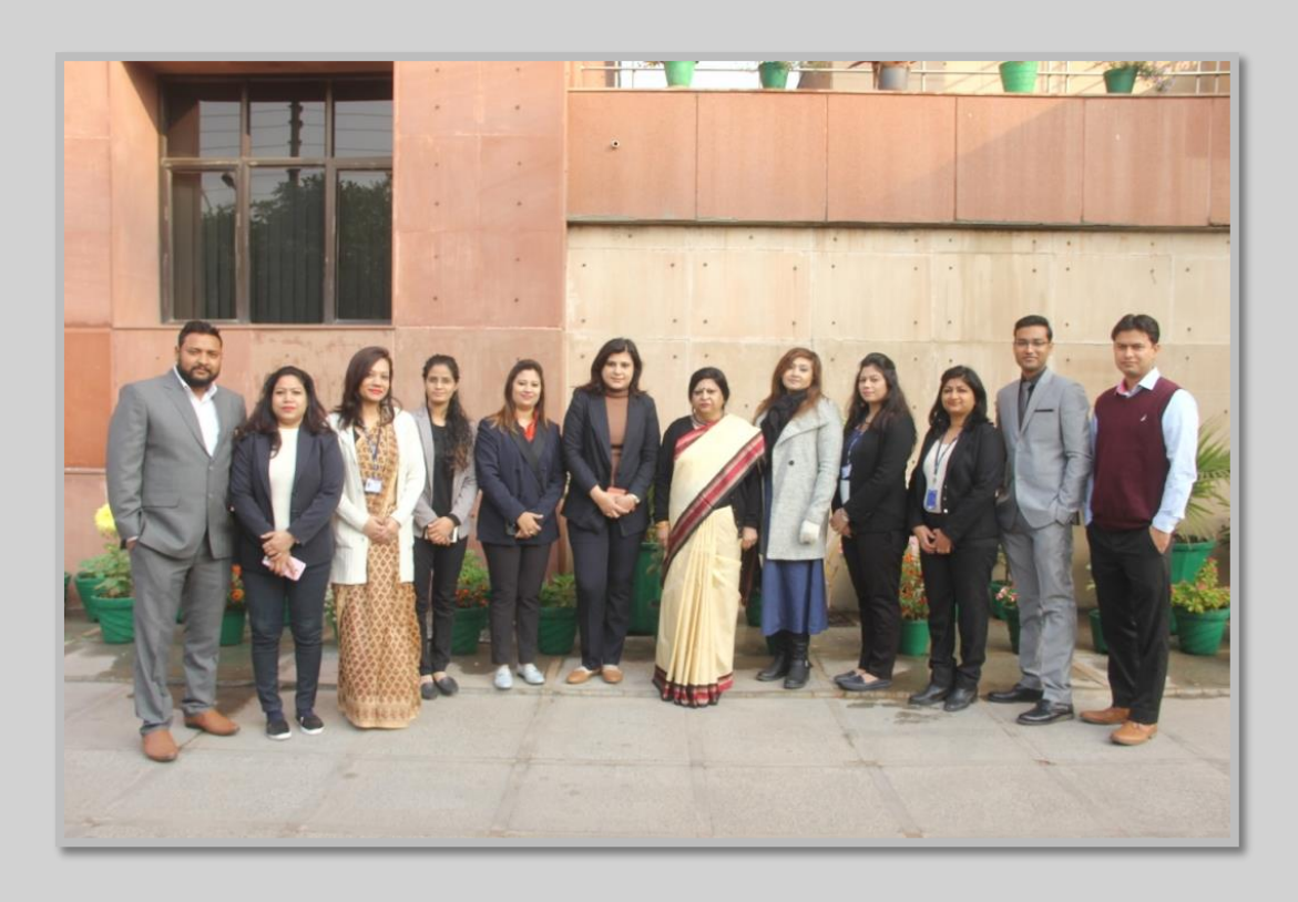
Faculty members of Satyam Fashion Institute welcoming Peer Team