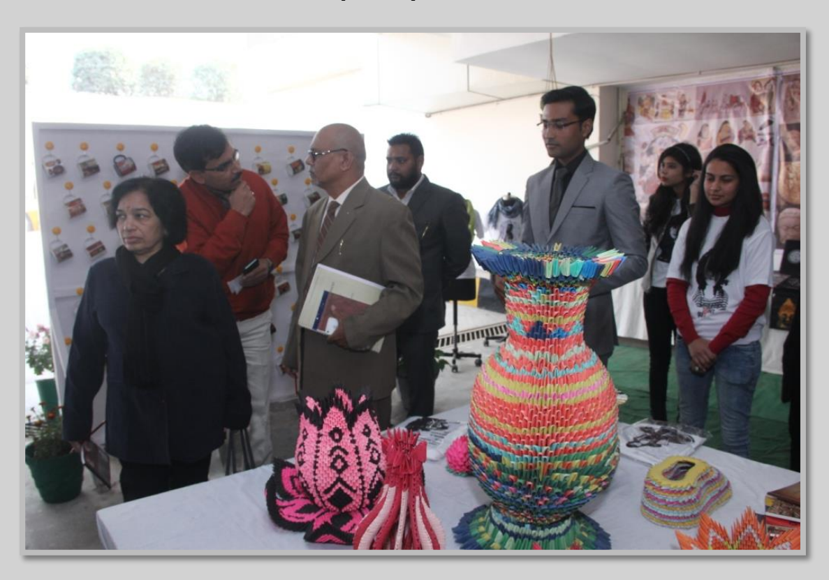
Visit to Exhibition by B. Des. Foundation Year