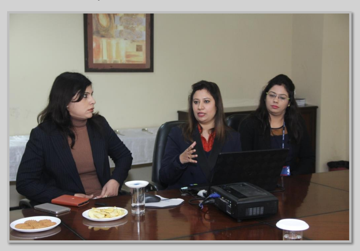
Presentation by IQAC Coordinator to NAAC Peer Team