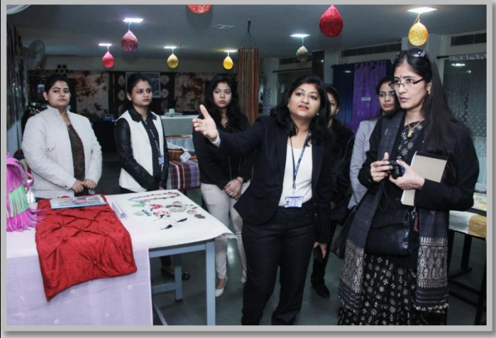
Visit to Exhibition by B. Des. Textile Design students