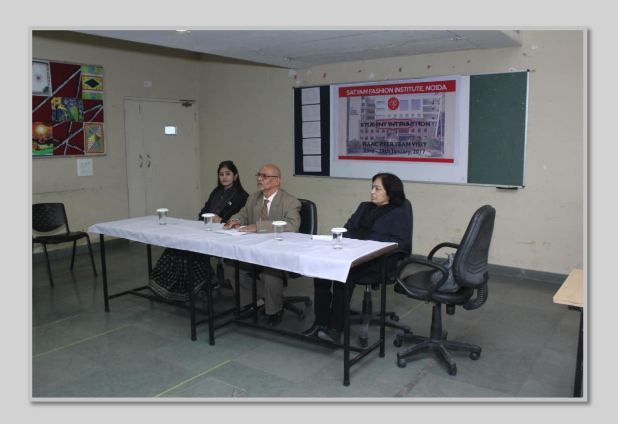
Interaction with students