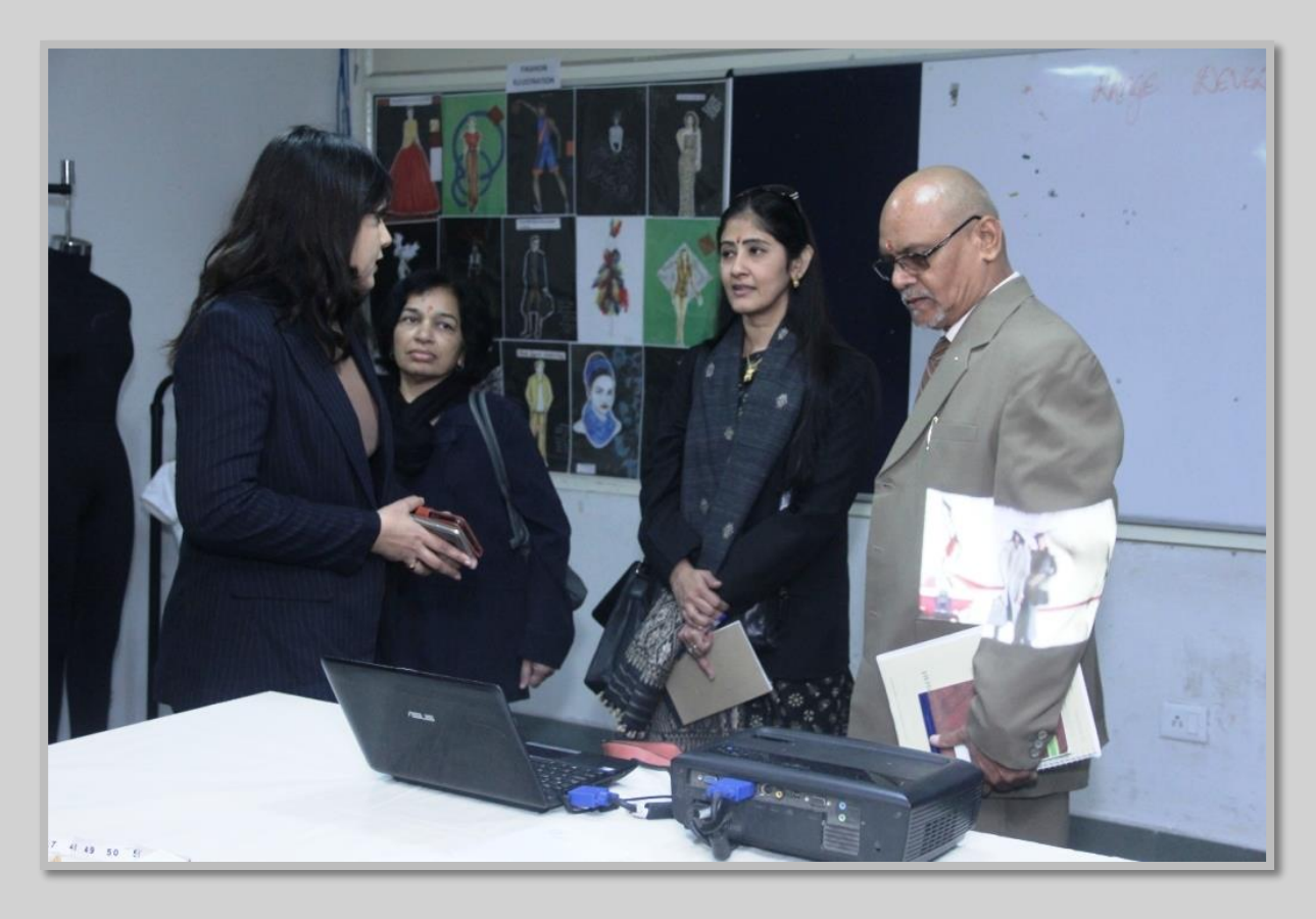
Interaction of Peer Team with Fashion Design Programme Coordinator