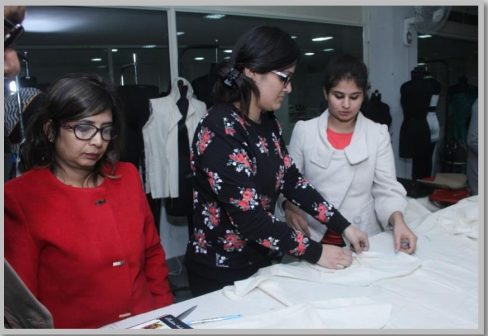
Visit to Draping lab and faculty interaction