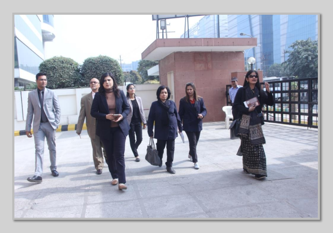
Visit to Campus