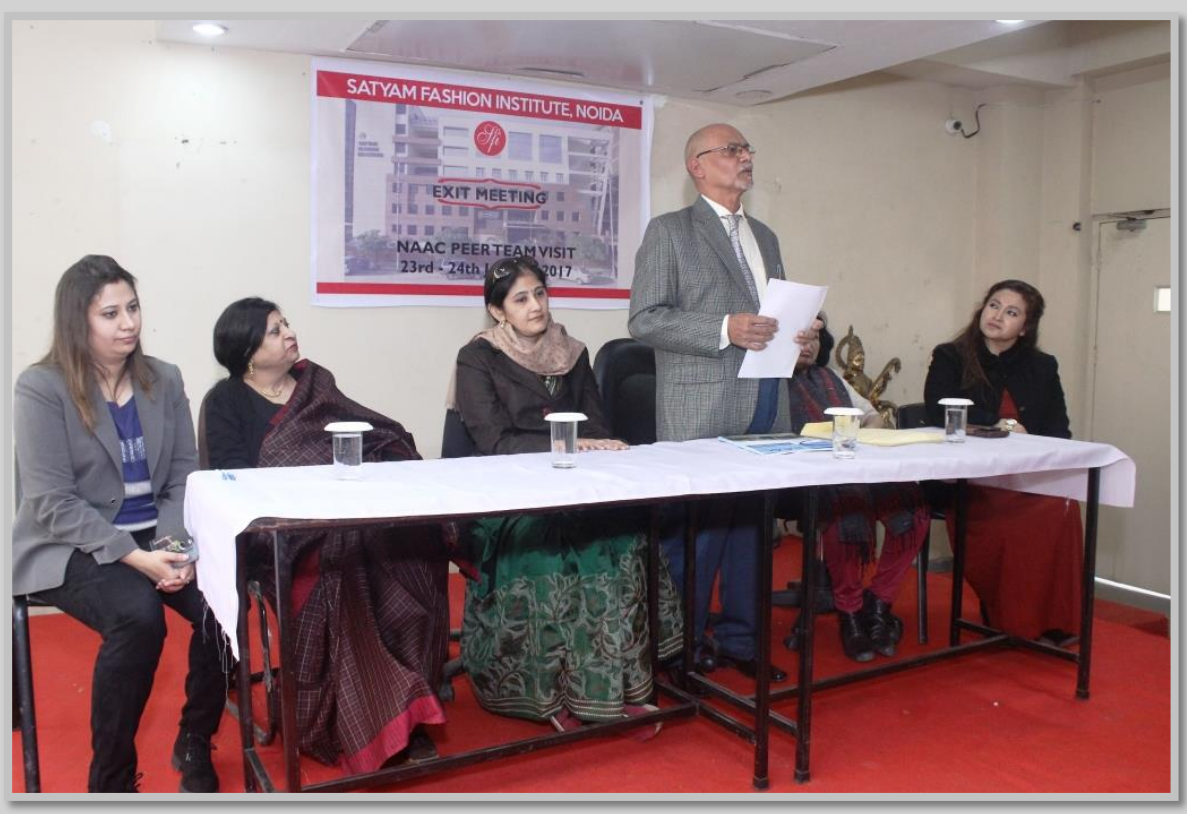
Exit Meeting – Sharing of views by Chairperson of Peer Team