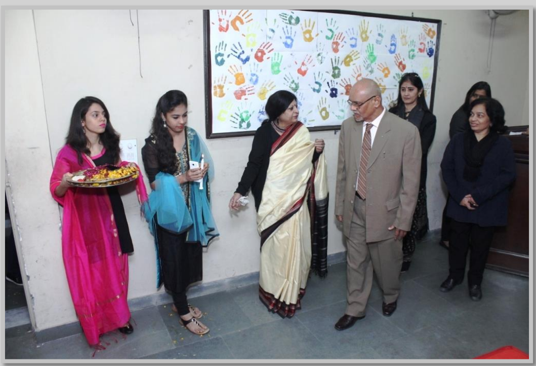
Lamp lighting – Cultural programme