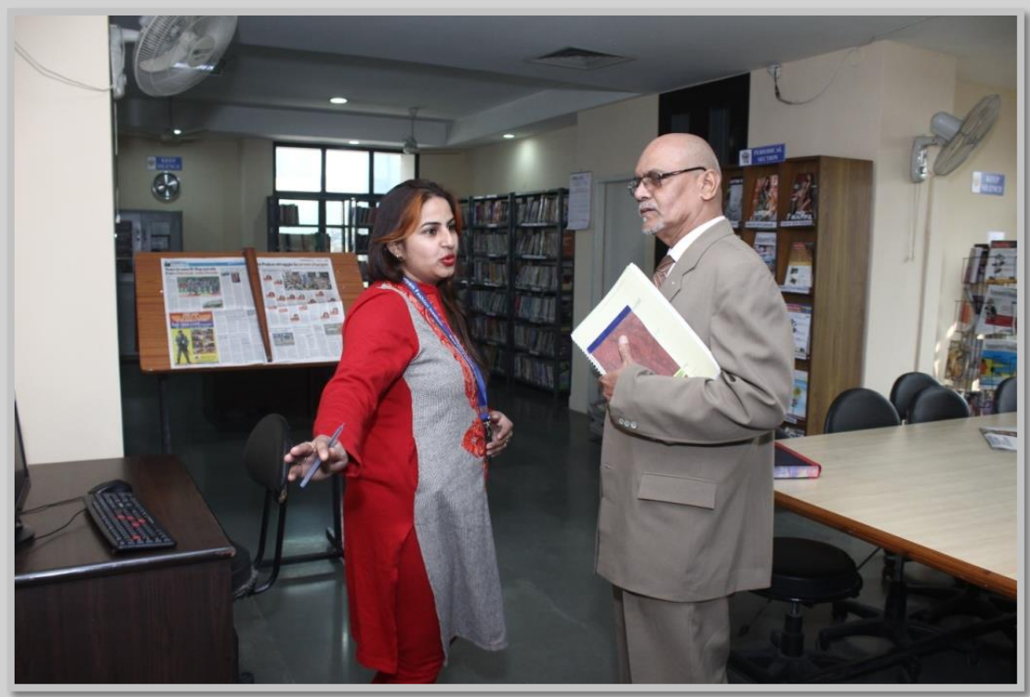
Interaction with Librarian