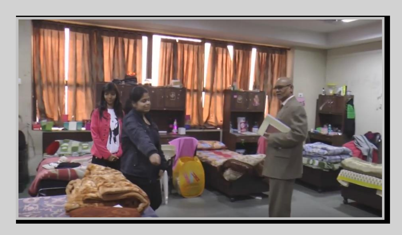
Visit to Hostel