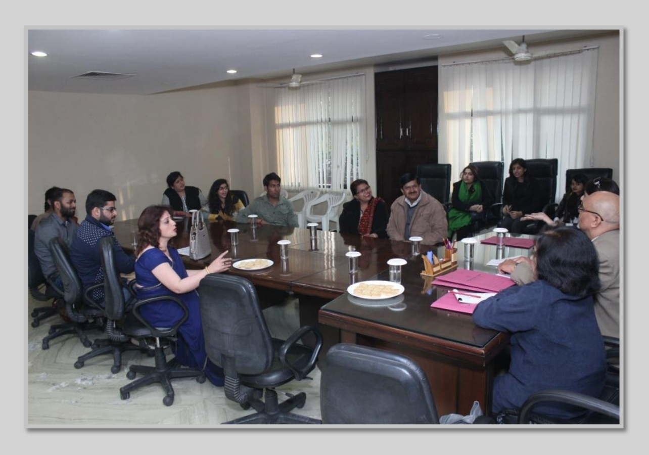
Interaction with parents