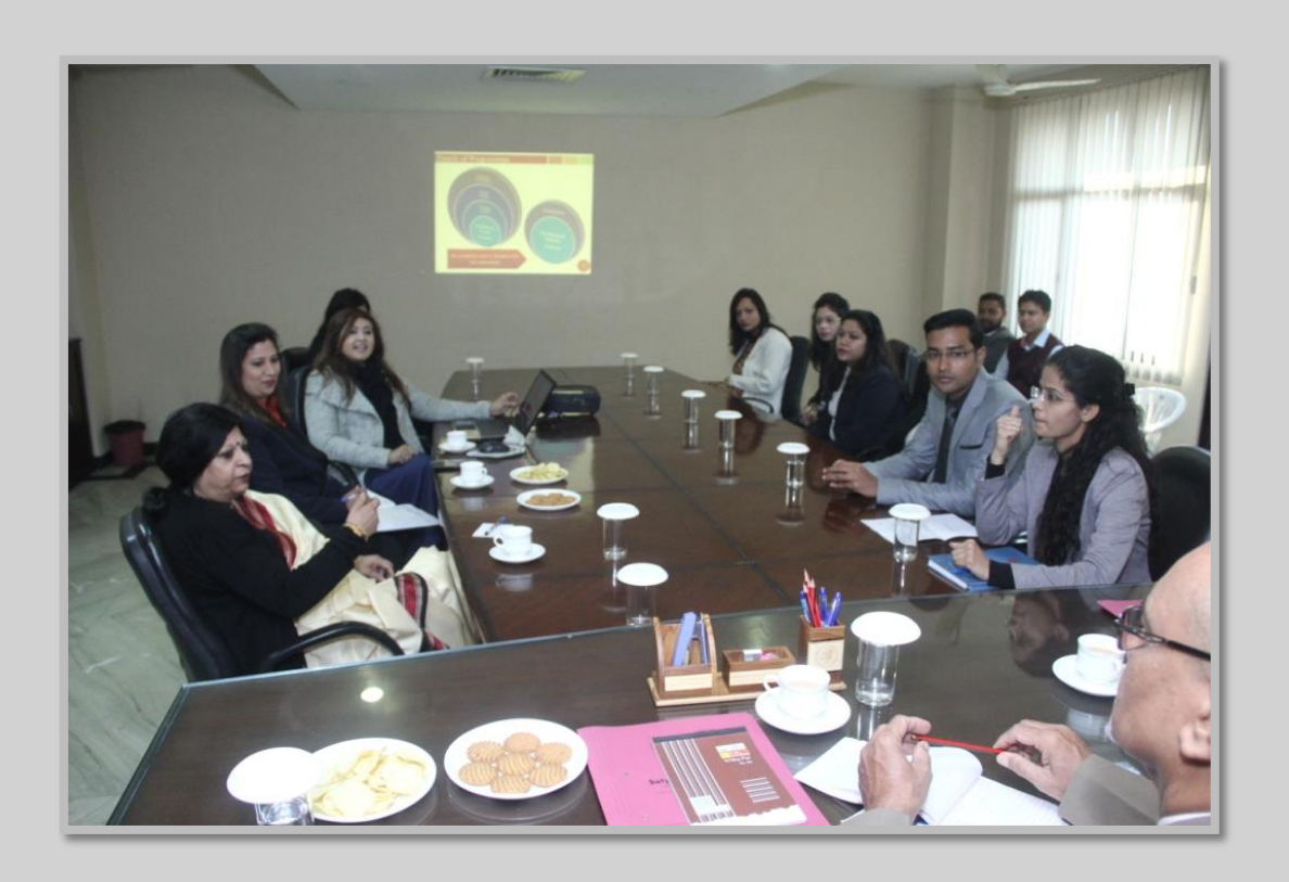
Principal's Presentation to NAAC Peer Team