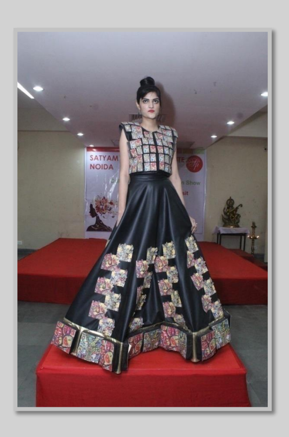
Fashion show by Fashion Design students