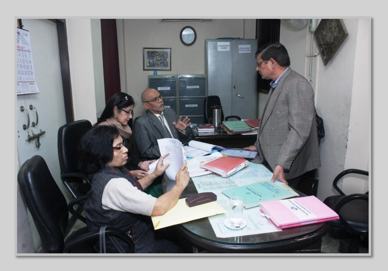
Checking of documentary evidences