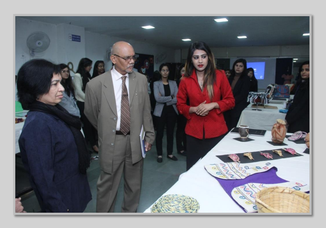
Visit to Exhibition by B. Des. Fashion Design students