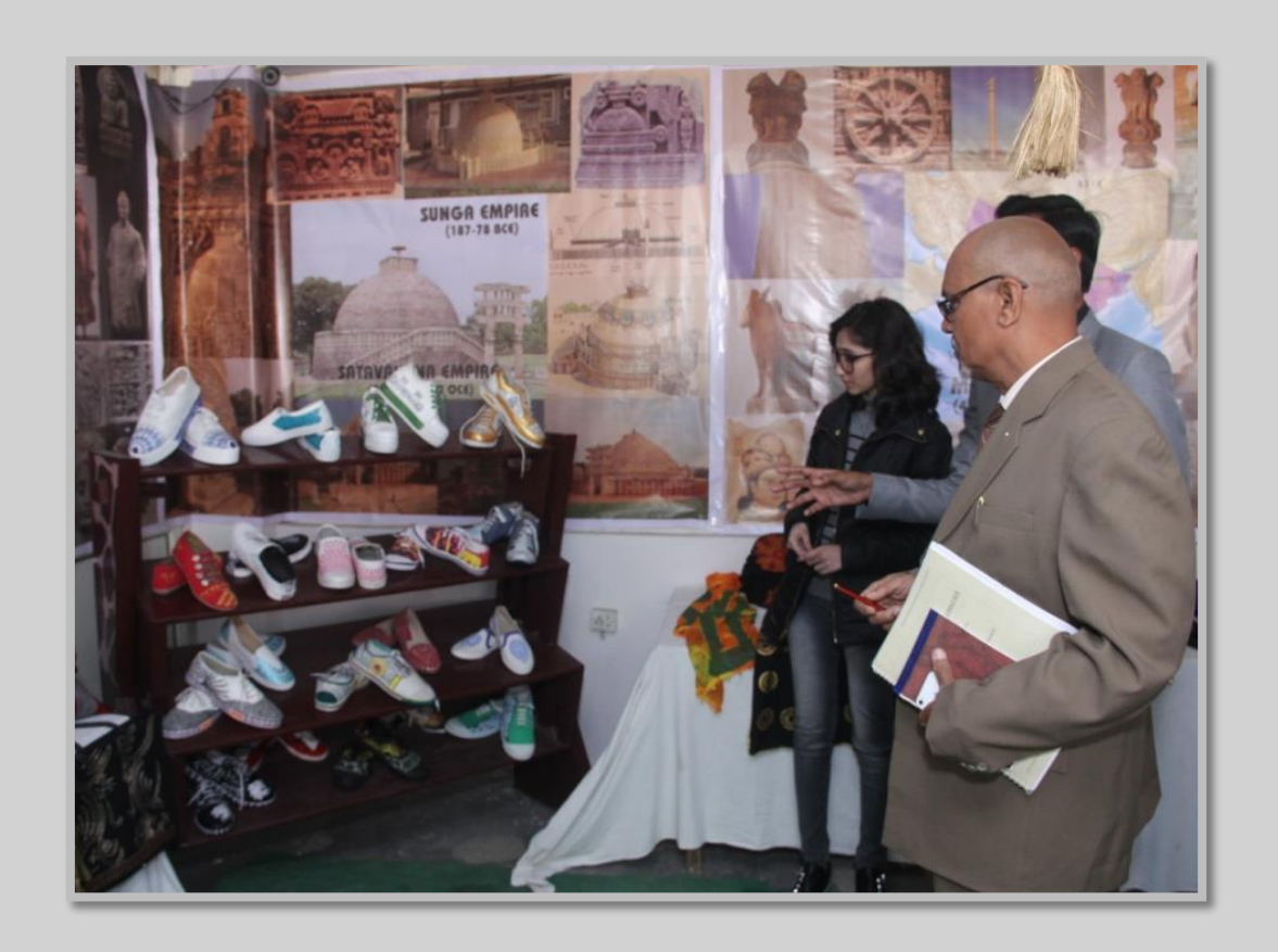
Visit to Exhibition by B. Des. Foundation Year