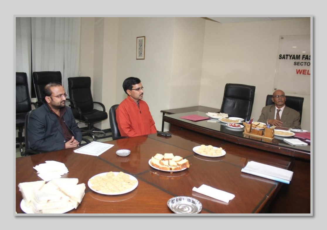
Interaction with administrative staff members