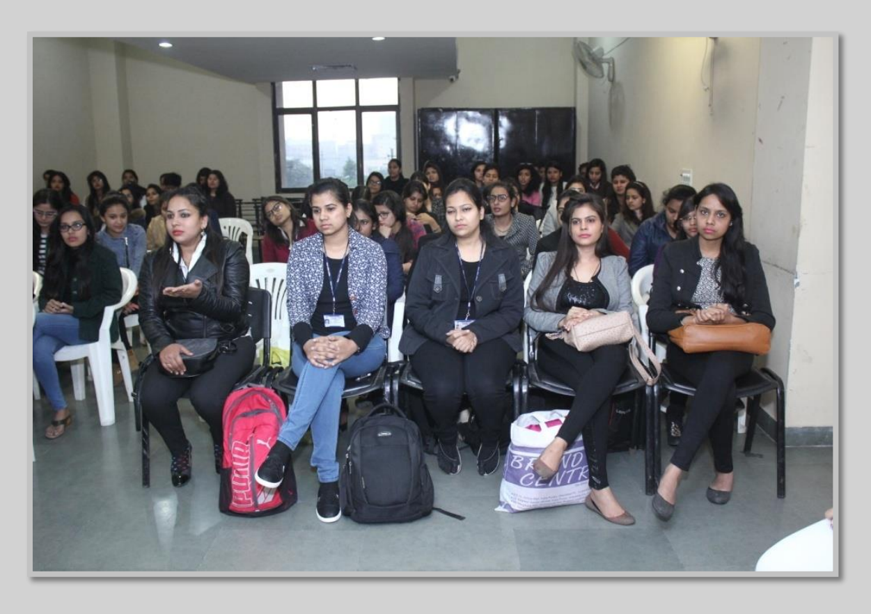
Interaction with students