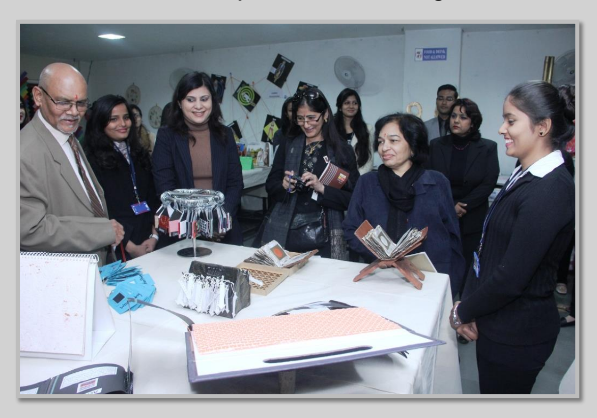
Visit to Exhibition by B. Des. Fashion Design students