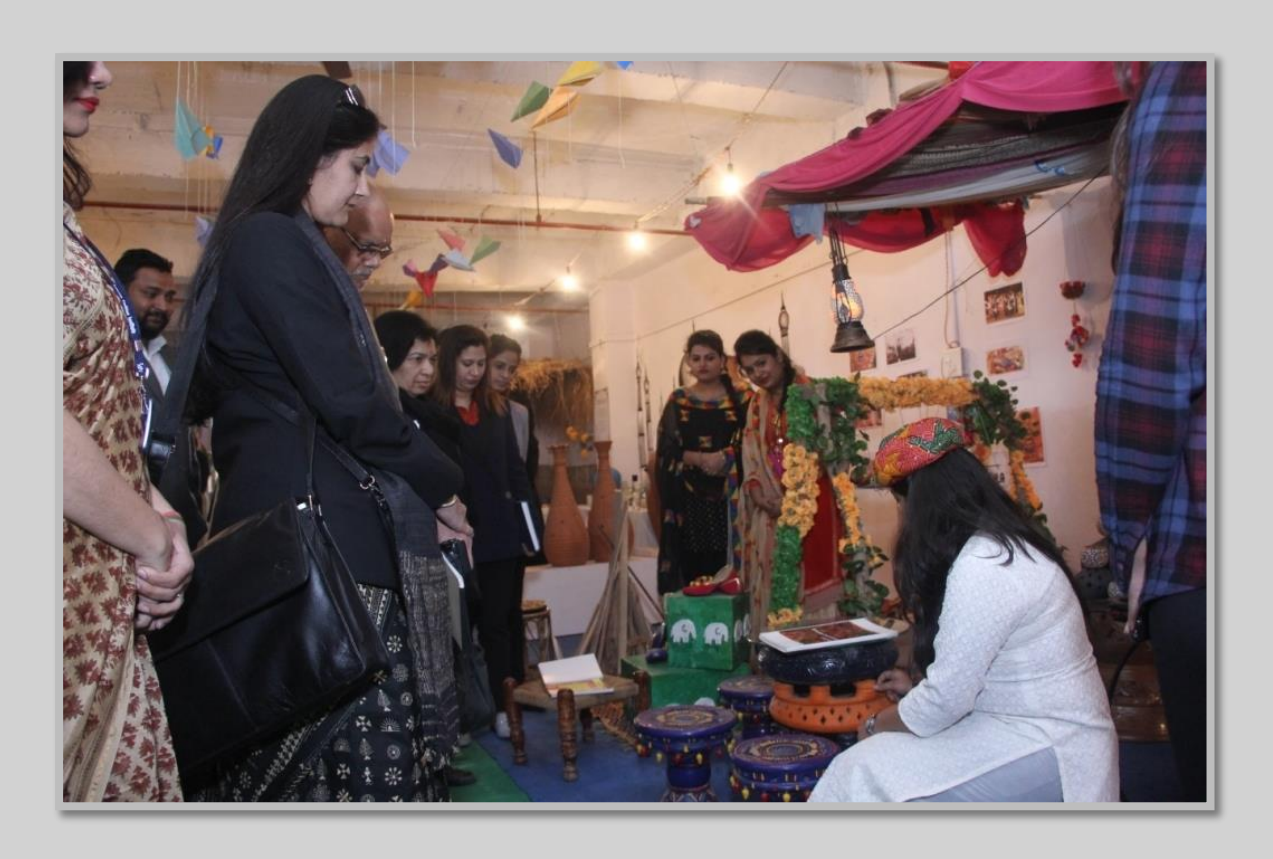
Visit to Exhibition by B. Des. Lifestyle Accessories students