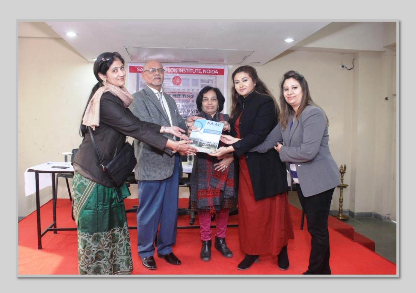
Sharing of NAAC Peer Team Report