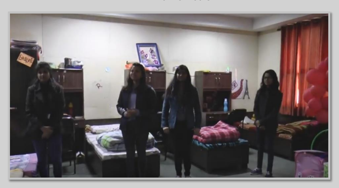
Visit to Hostel