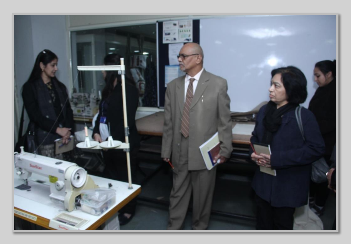
Visit to Garment Construction Lab