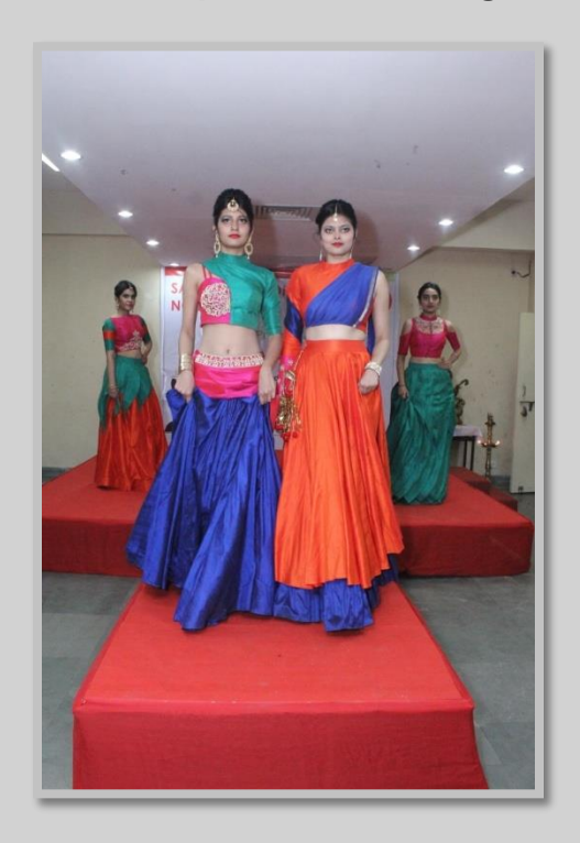
Fashion show by Fashion Design students