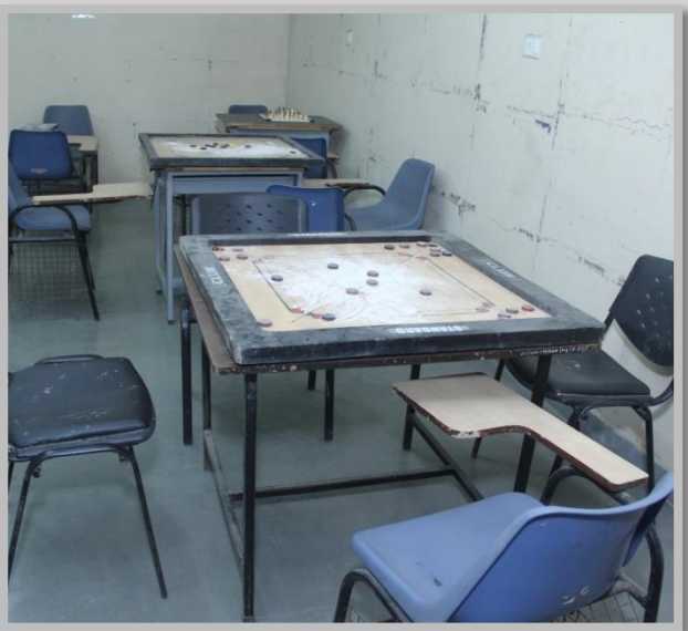
Indoor Sports facilities