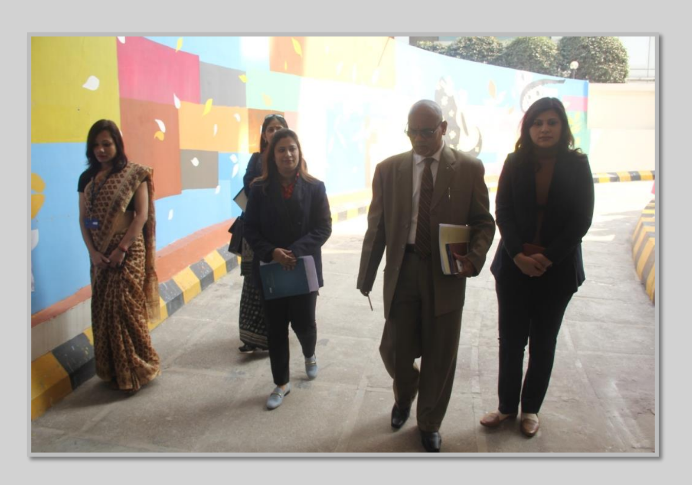
Visit to Campus by NAAC Peer Team