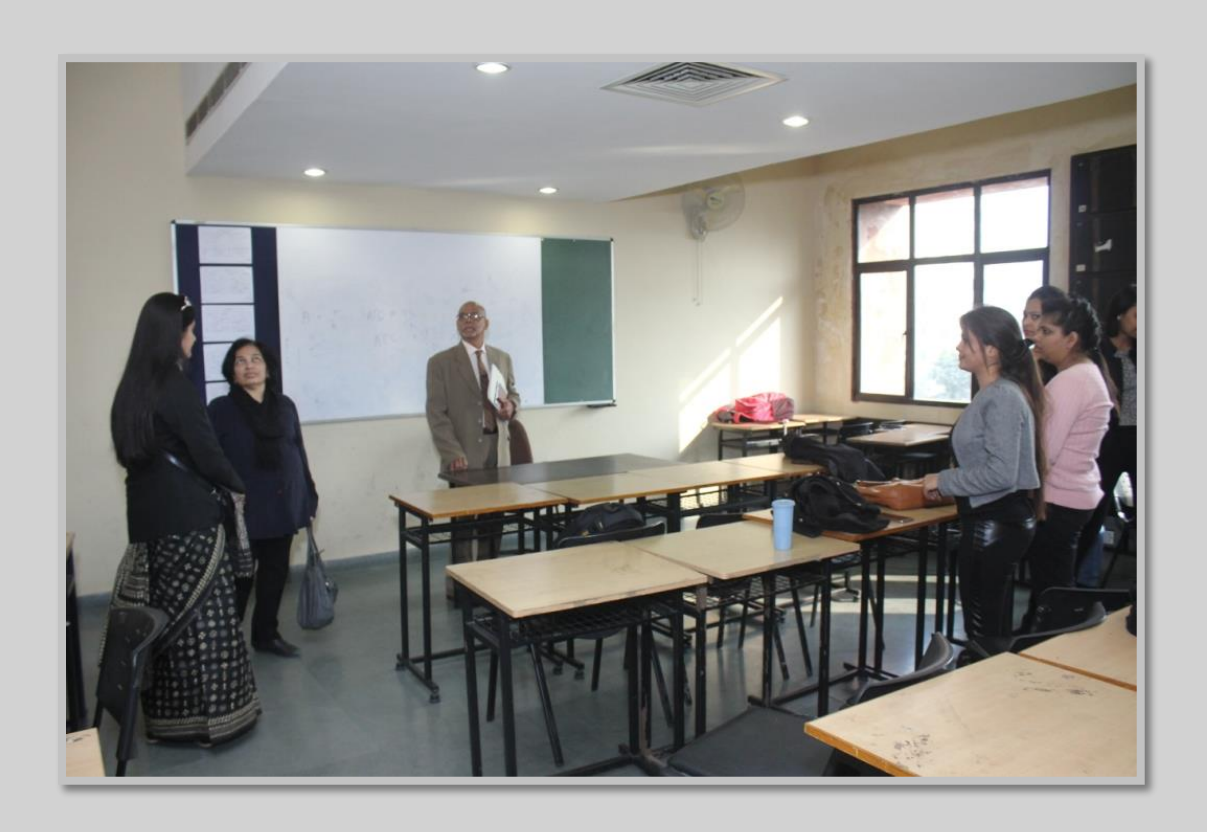
Visit to Lecture rooms