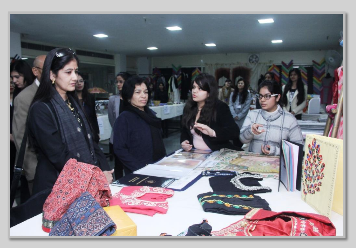
Visit to Exhibition by B. Des. Fashion Design students