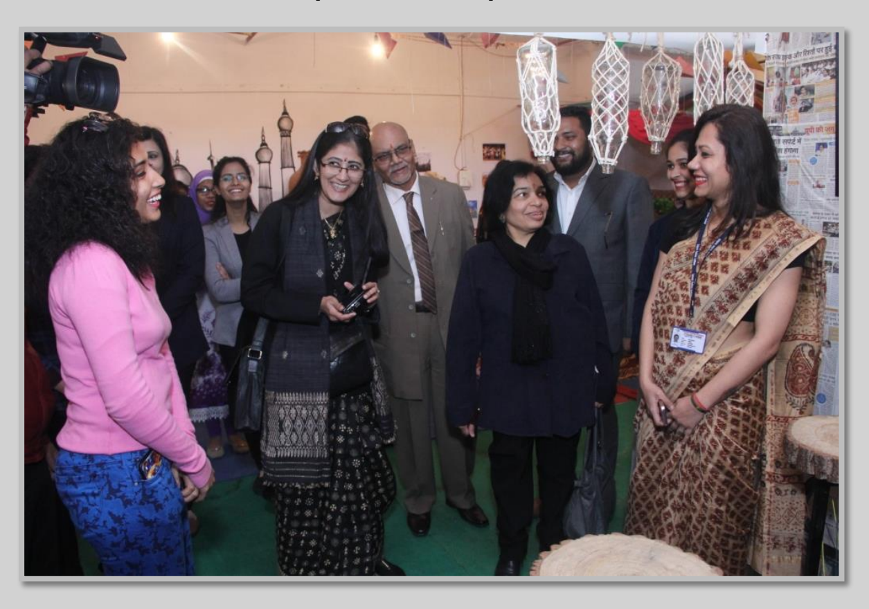
NAAC Peer Team interacting with students during exhibition