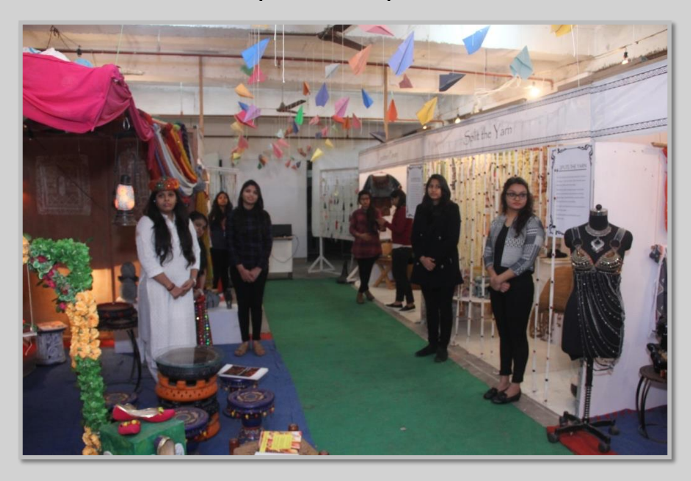
Visit to Exhibition by B. Des. Lifestyle Accessories students