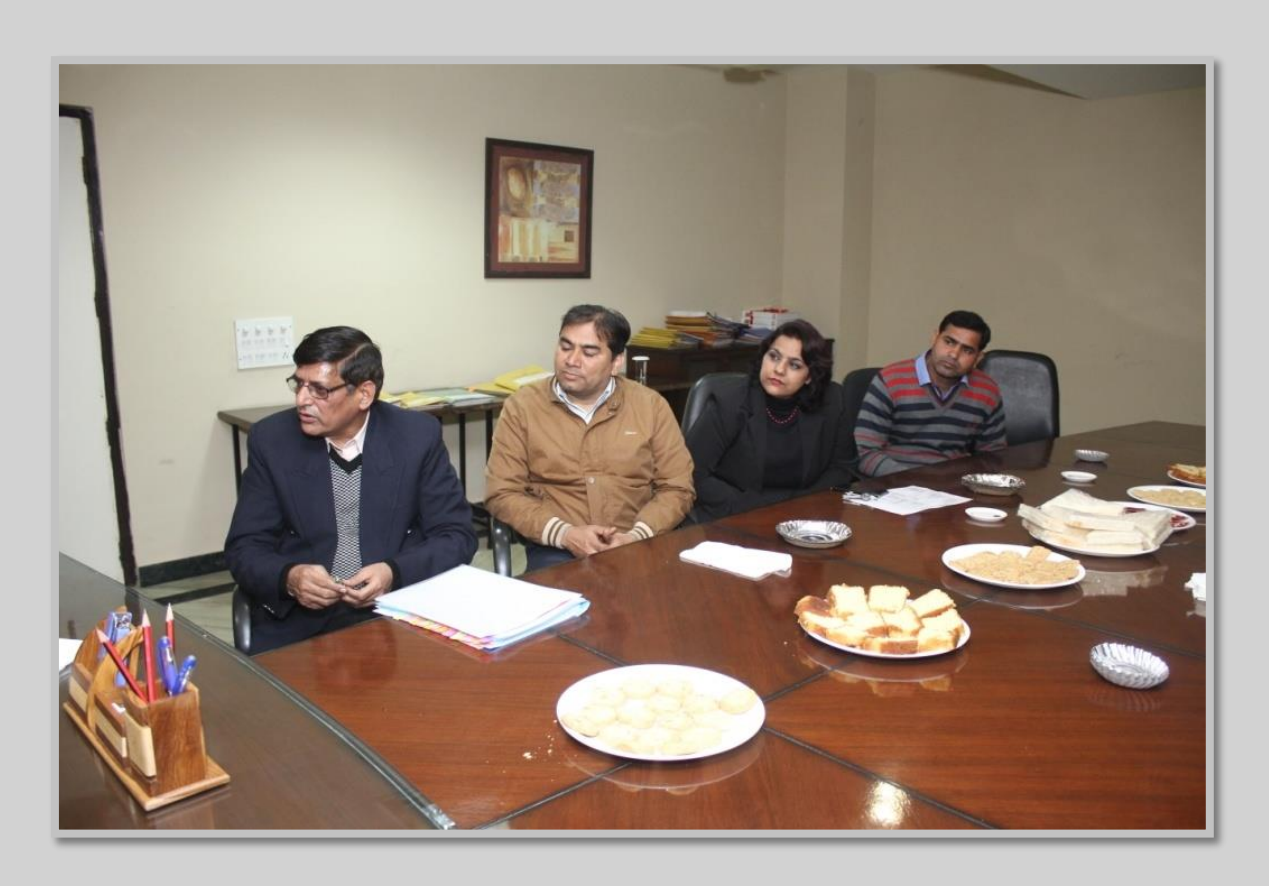
Interaction with administrative and technical staff members