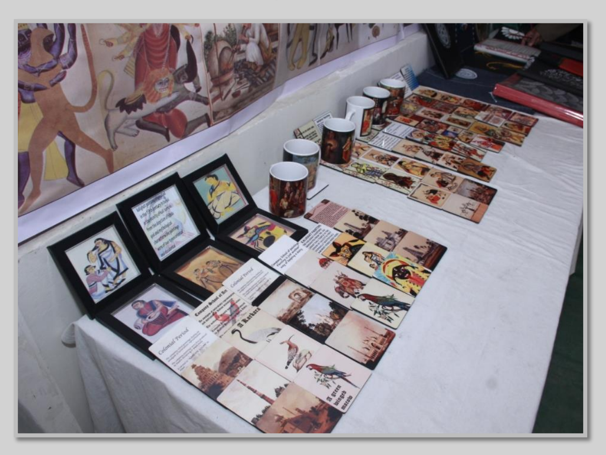
Visit to Exhibition by B. Des. Foundation Year