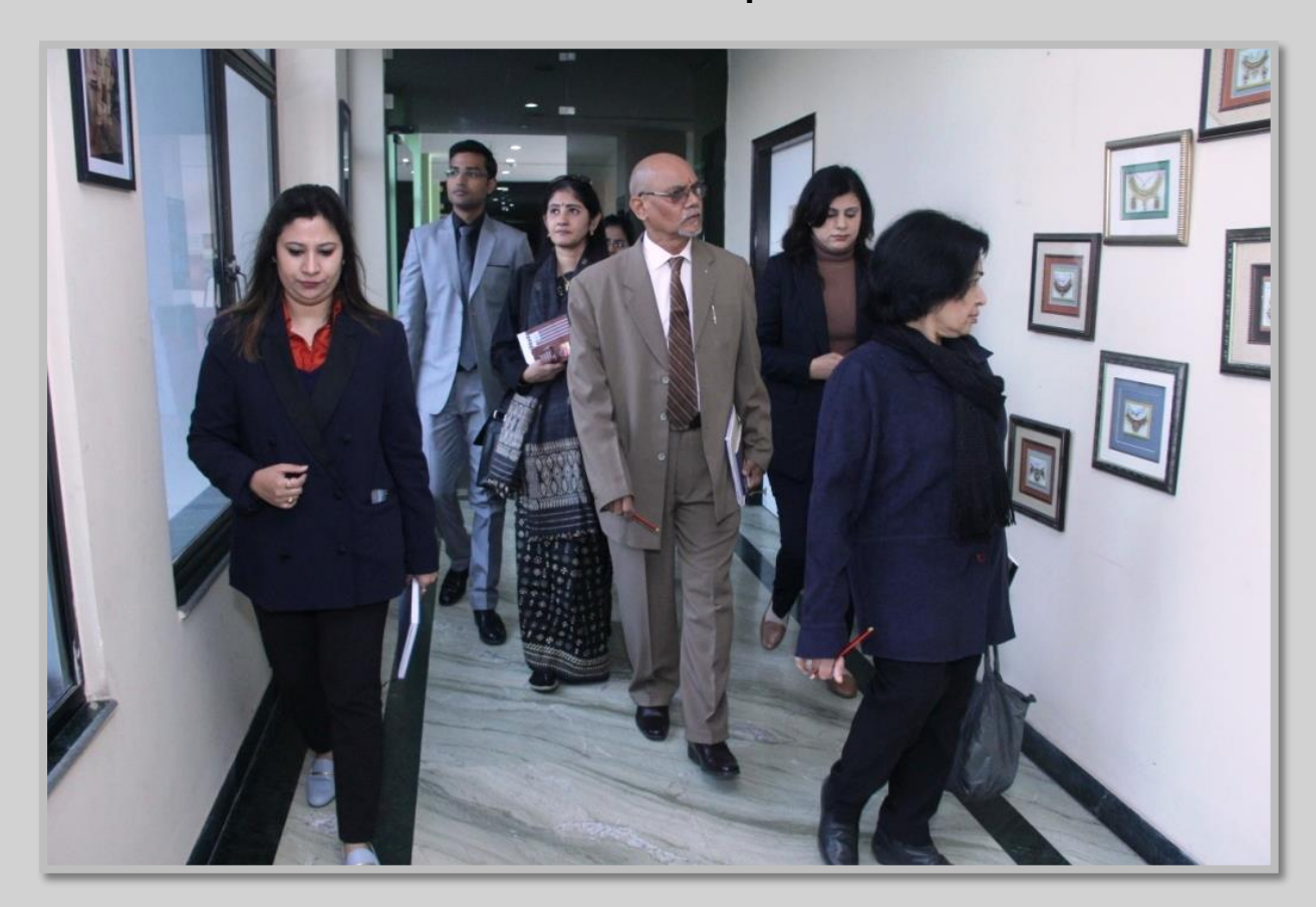
Visit to Campus