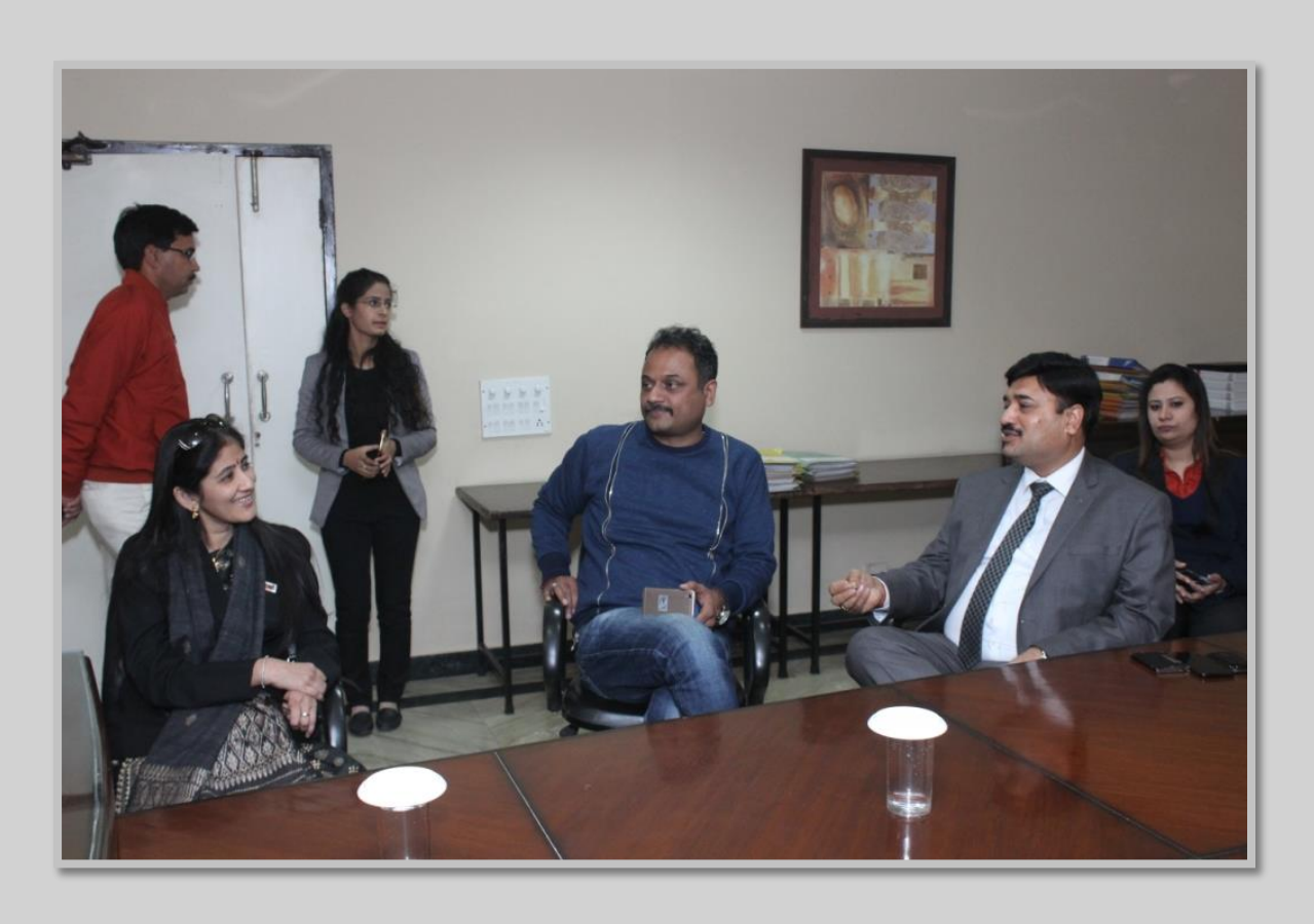
Interaction with industry persons